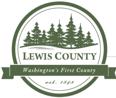
Exhibit A: Statement of Work and Reporting Requirements

The purpose of this Statement of Work is to detail the work to be performed by HRC and the methods and content for reporting progress by HRC in fulfilling all duties encompassed in this MOU.