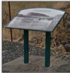
(Customer supplied sample)